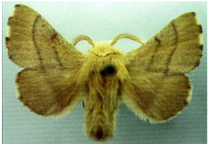
Figure 2. The moth stage of forest tent caterpillar.

FTC is often confused with a close relative, the eastern tent caterpillar. Despite its name, FTC does not form a tent. Rather,