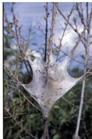
Figure 4. Tent formed by the eastern tent caterpillar. FTC does not form a tent.