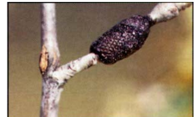
Figure 3. Forest tent caterpillar egg mass.

young caterpillars make a pad of silk where they rest and molt. Eastern tent caterpillars make a neat silken tent (fig. 4). Also, the eastern tent caterpillar feeds almost exclusively on cherry,