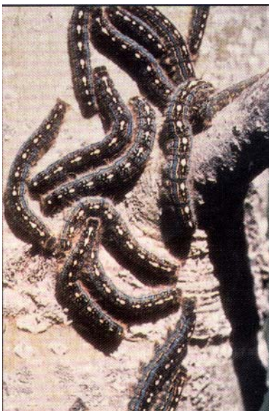
Figure 1. Forest tent caterpillars.