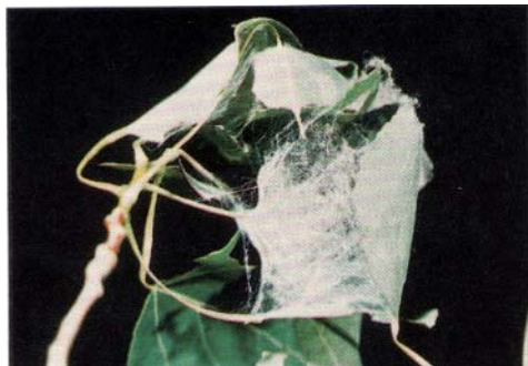
Figure 6. Leaves tied together with silk. A cocoon is inside the rolled leaves.

FTC has one generation per year. Caterpillars emerge from overwintering eggs in the spring when the new leaves are beginning to unfold. Young caterpillars stay together and move about in a single file, following silk trails. They often congregate to rest or molt on silken mats found on the trunk or branches. Five to six weeks after hatching, the caterpillars finish feeding and spin cocoons of yellow silk in folded leaves (fig. 6),