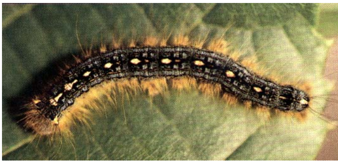
Figure 5. Gypsy moth caterpillar (above) and forest tent caterpillar (below).