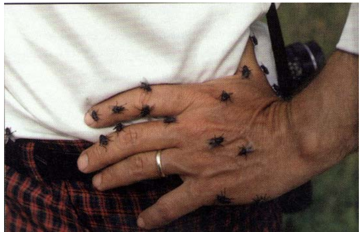
Figure 7. Sarcophaga aldrichi , a native parasitic fly that attacks forest tent caterpillar pupae. They often become very abundant near the end of an outbreak.

FTC populations fluctuate greatly, with huge outbreaks followed by years in which a single caterpillar can be hard to find. What starts an outbreak is poorly understood. Before most outbreaks, localized pockets of defoliation are observed. Within a year or two, these small areas expand to include millions of acres. Several factors can terminate an outbreak or lessen its intensity. Freezing weather just before, during, or after egg hatch, can kill eggs and young caterpillars. Starvation can occur when millions of caterpillars literally eat all of their food supply. The resulting starvation leads to disease epidemics. FTC has natural enemies that include parasites, predators, and pathogens. In the Upper Midwest, one of the more common natural enemies of FTC is a large gray fly called Sarcophaga aldrichi (fig. 7). This fly is locally referred to as the "friendly fly" or the "government fly." It is a native parasite that has evolved with FTC. It lays tiny maggots on the cocoons of FTC and the maggots eat the developing pupa inside the cocoons. S. aldrichi becomes very numerous near the end of outbreaks. In many cases the flies become more of a nuisance than the caterpillars. This fly does not bite but often lands on people, laundry, and light-colored cars and siding. Natural enemies of FTC become more and more common during outbreaks, and after 2 to 5 years they are killing so many FTC that the outbreaks subside.